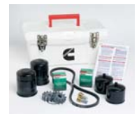
Cummins Onan Cruise Kit