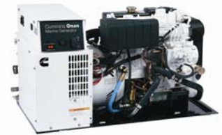
Standard model without sound shield shown