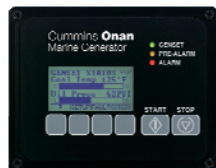
Cummins Onan Digital Display